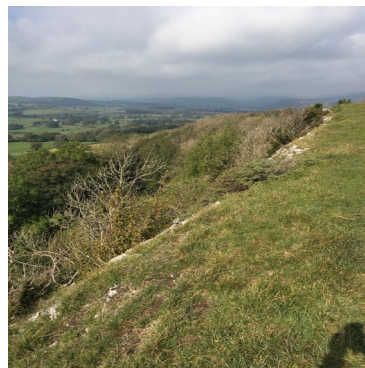
The Woods below Cunswick Scar