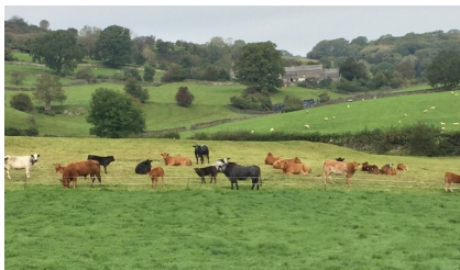
Lush pastures Provide fodder for the healthiest of farm livestock.